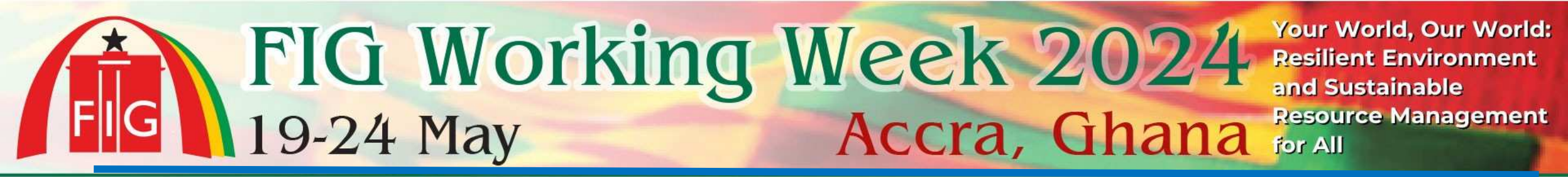
FIG Commission 9 "Valuation and the Management of Real Estate",

Markets do not function rationally - they are MISBEHAVING