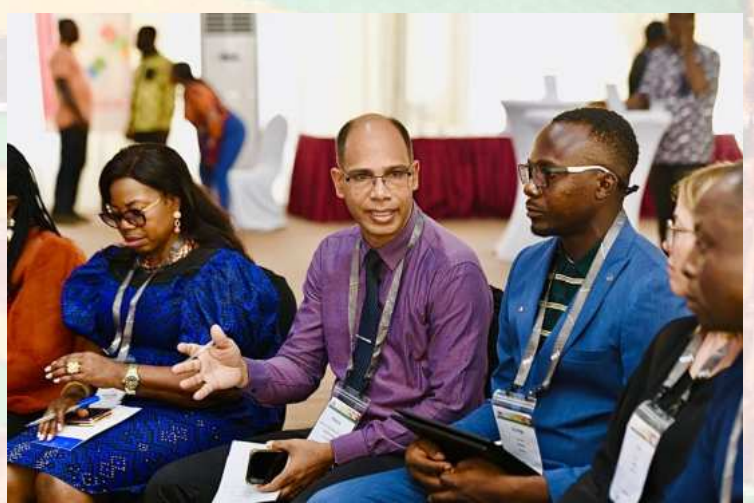
Networking: Annual Commission Meeting Joint Commission Dinner 4, 5 & 6