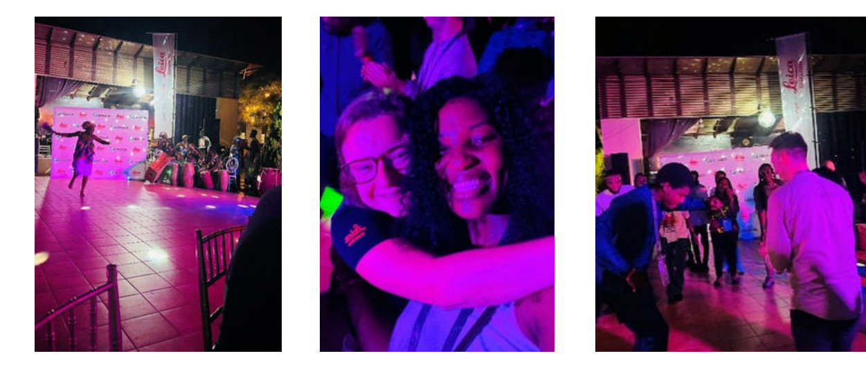
A heartfelt thank you to Leica for their unwavering support and commitment to the surveying community.