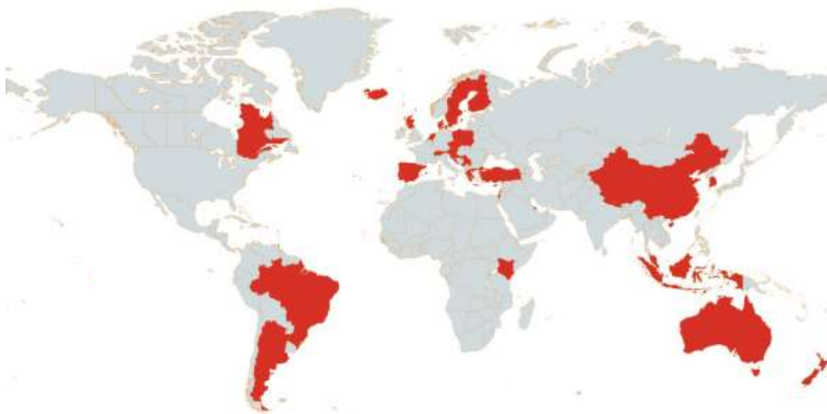
Figure 1. Spatial distribution per continent of the countries that have participated in the 4 th Questionnaire of 3D Land Administration (current status of 2022 and expectations for 2026).

At the following figure, the spatial distribution of the countries that have participated in the 4 th Questionnaire on 3D Land Administration is preseted.