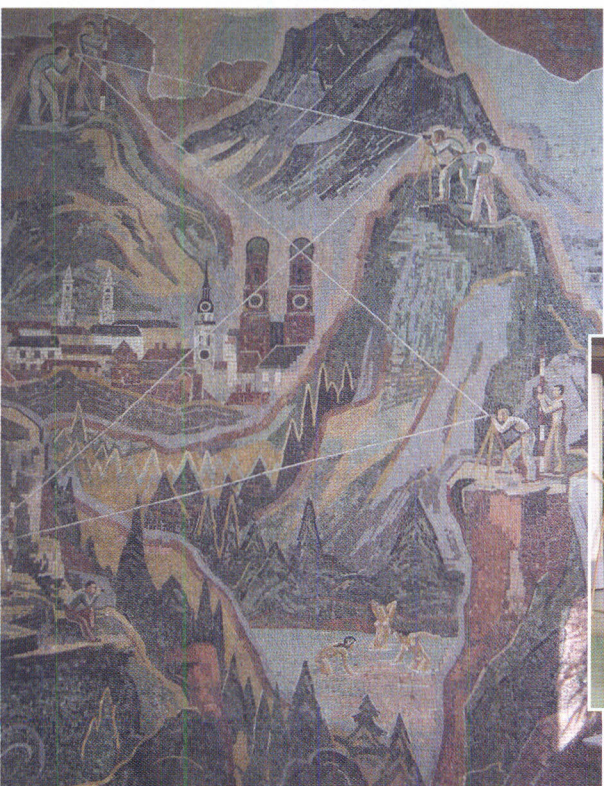
This wonderful mosaic sits on the wall of the LVG's entrance foyer. Does a successful survey mean the lads get to swim with the girls?

During the lunch break each course was punctuated by a troupe of dancing girls... Dancing Girls? In a mapping agency? To be fair Hausgemacht (it means homemade in English) is four girls and one guy; they put on a charming interpretation to music whilst weaving and rolling in and out of a geodesic polygonal wood-framed structure. It was an interesting diversion by a talented multi-national group of young people. Other mapping agencies should follow suit.