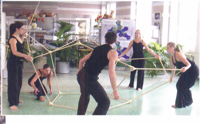
Above: Hausgemacht entertained us with a sort of geodetic dance.