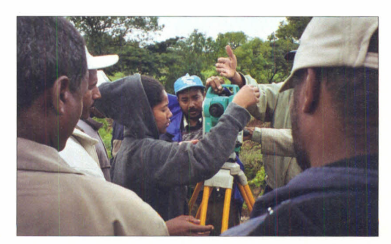
On-the-job training in surveying.