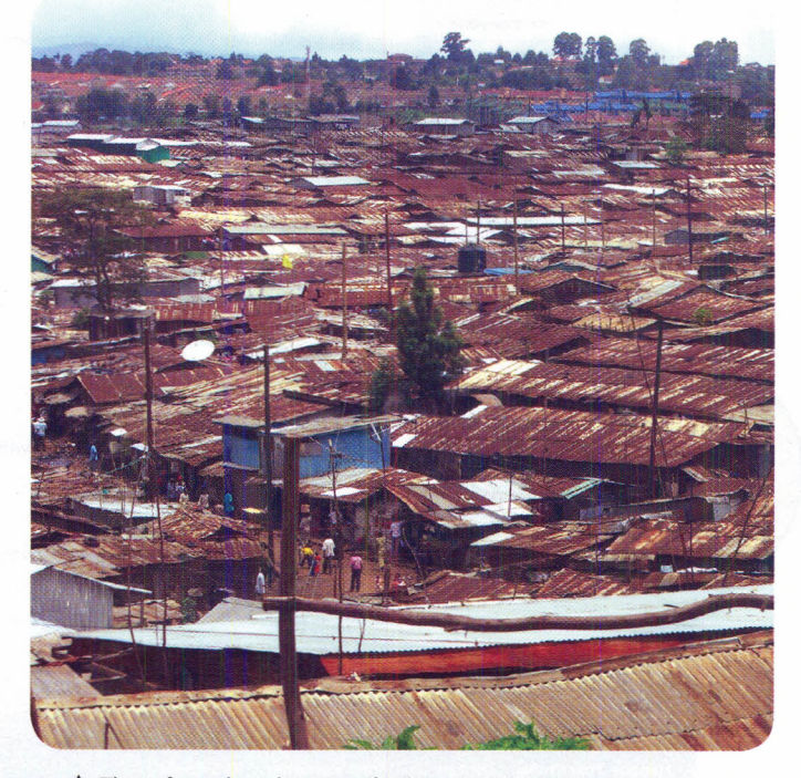
The informal settlement of Kibera in Nairobi, Kenya covers 371 acres (150 hectares) and houses one million-plus slum dwellers

surveying in 1970, working for ten years as a consultant surveyor in private practice. For further information see http://www.land. aau.dk/~enemark.