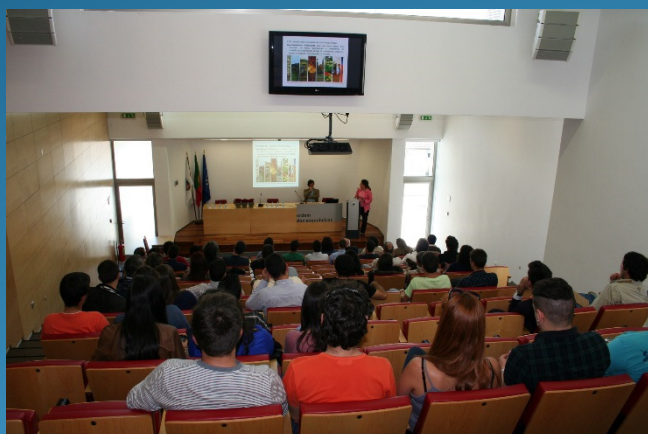
Regional Conference - Coimbra