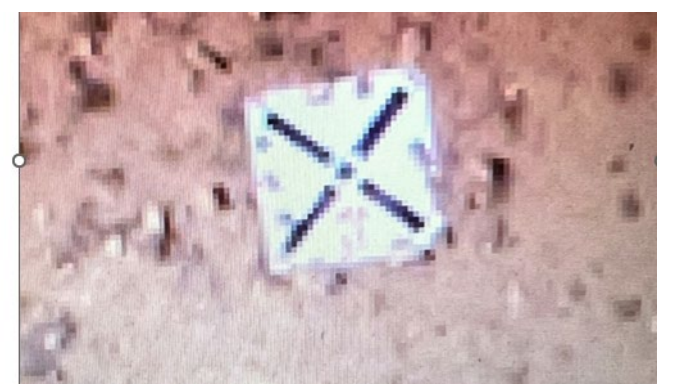
Figure 1. GCP marked on the ground (left) and GCP as seen in imagery (right).