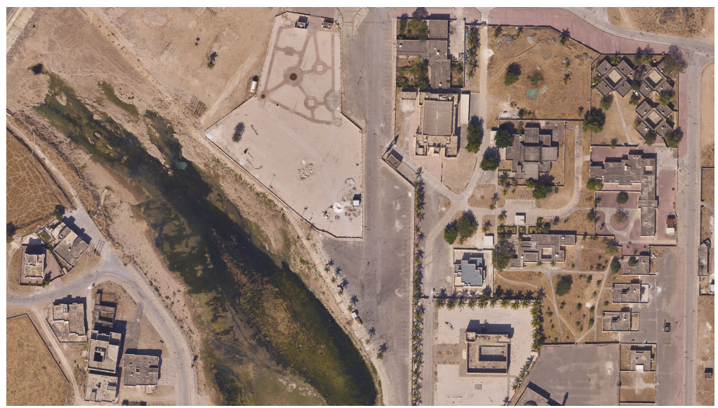
Figure 2. Example of final 5cm resolution image.

Many thousands of individual images were captured during the flight missions and were photogrammetrically processed and checked against the ground control, resulting in the orthomosaic and digital surface model (DSM) products for the AOI. Software was used to overcome challenges such as color difference, lighting, and cloud cover, resulting in clear final imagery. The resolution of the final mosaic was 5cm (Figure 2).