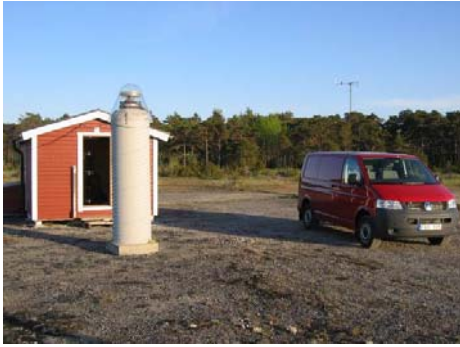
Figure 4: Visby, a permanent GNSS station as well as absolute gravimeter