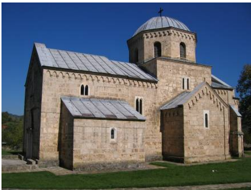
Figure 5: Gradac

Lantmäteriet works international through the company Swedesurvey. A project is currently running in Serbia that includes some geodetic components. During 2007, three points were observed with absolute gravimetry. The three points (Grgeteg, Gradac and Sicevo) were decided in June and the observations were done during October. The result was over our expectation and our collaborative partner in Serbia was very pleased. Figure 5 and 6 shows one of the points.