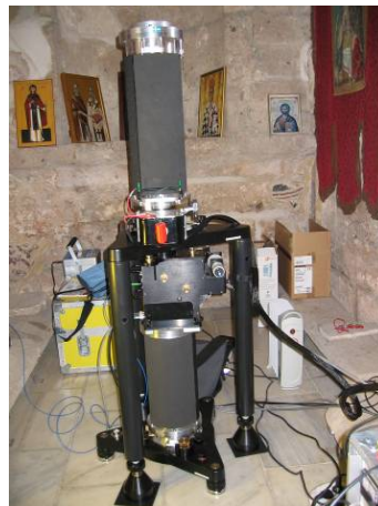
Figure 6: The set-up at Gradac