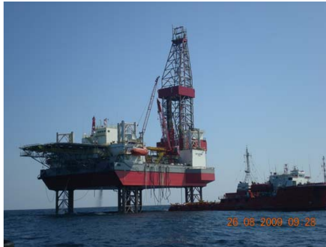
Fig 1: Jack-up platform

Originally conceived as a bottom-supported drilling unit, semisubmersibles ( semisubs ) eventually found their true calling (Fig 2). Now, semisubs are the most stable of any floating rig, many times chosen for harsh conditions because of their ability to withstand rough waters. A semisubmersible is a MODU designed with a platform-type deck that contains drilling equipment and other machinery supported by pontoon-type columns that are submerged into the water.