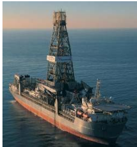
Fig 3: Drillship (Deepwater Millennium), (URL1, 2010)

vessels, such as tugs or barges, and some have their own propulsion method for transport. Based on the way the rig is submerged in the water, there are two main types of semisubmersibles: bottle-type semisubs and column-stabilized semisubs. Mooring lines are then used to keep the semisub in place, and these anchors are the only connection the rig has with the sea floor. As a semisub, the rig offered exceptional stability for drilling operations, and rolling and pitching from waves and wind was greatly diminished. In addition to occasional weather threats, such as storms, cyclones or hurricanes, some drilling locations are always harsh with constant rough waters. Being able to drill in deeper and rougher waters, semisubs opened up a new avenue for exploration and development operations (URL3, 2010).