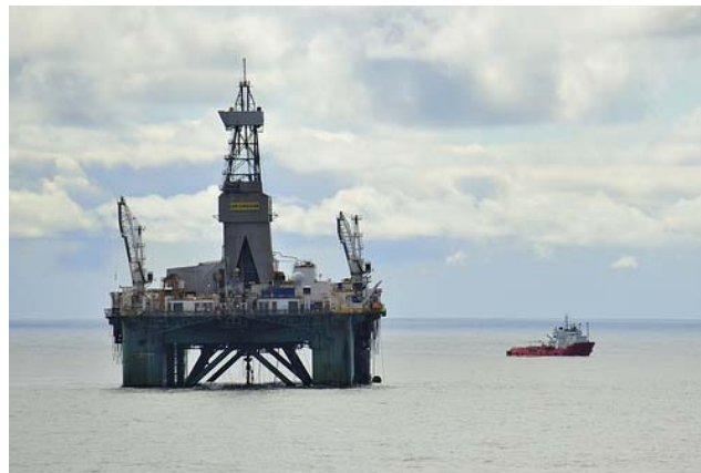
Fig 2: Semisub (Leiv Eiriksson), (URL2, 2010)

Originally conceived as a bottom-supported drilling unit, semisubmersibles ( semisubs ) eventually found their true calling (Fig 2). Now, semisubs are the most stable of any floating rig, many times chosen for harsh conditions because of their ability to withstand rough waters. A semisubmersible is a MODU designed with a platform-type deck that contains drilling equipment and other machinery supported by pontoon-type columns that are submerged into the water.