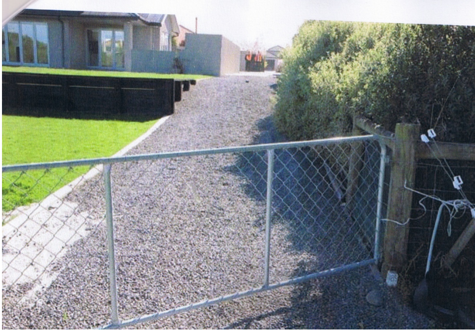
Figure 6 – Boundary point has moved 2.8 metres due to lateral spreading as a result of liquefaction