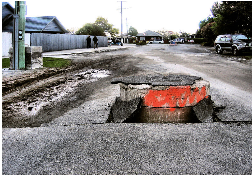
Figure 2 – A stormwater manhole raised by liquefaction

Figure 2 illustrates the extrusion of a stormwater manhole structure through the road surface due to the effect of liquefaction.