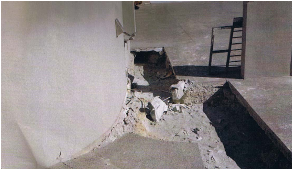
Figure 5 – Displacement due to liquefaction

Figure 5 is an example of the rifts created between buildings and paving which were originally adjacent. In the case of wooden framed buildings on masonry foundations, the foundations often split and moved out from beneath the wooden framing.