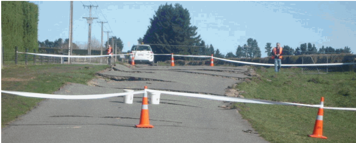
Figure 4 – Effects of fault rupture – previously straight road

The differential movement on either side of the fault is principally horizontal with local areas of vertical movement.