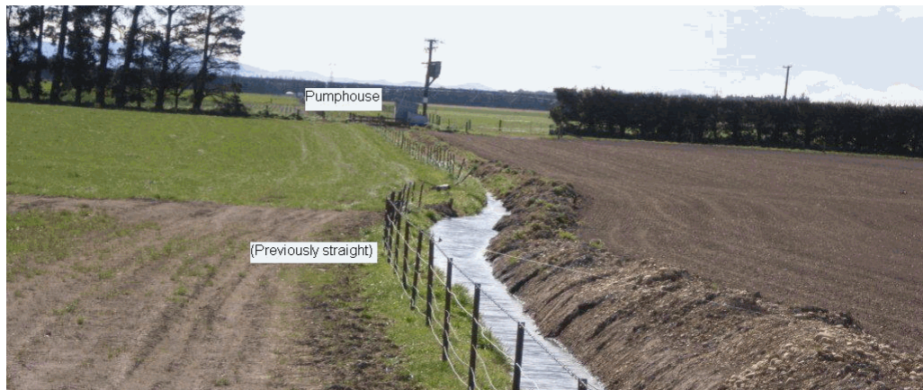
Figure 3 – Effects of fault rupture on previously straight fence and water race

The surface fault rift passes through approximately fifty separate cadastral land parcels in a rural area used primarily for agriculture and horticulture.