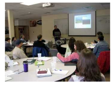
Figure 4. NGS Training Center, Corbin, Virginia

A training facility owned and operated by NGS supports workshops in field procedures and data processing, as well as informational presentations on basic geodesy and surveying (Figure 4). Many of these are available online through webinars, and are frequently taped and available for users who cannot attend the live webinar. These activities supplement the