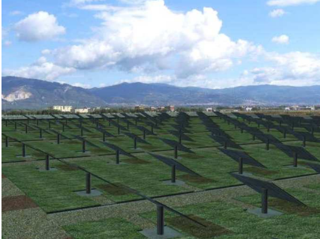
Figure 4. Visual simulation of a sun-tracking PV installation

The short analysis of the documents that are currently produced during the authorization procedure of a PV plant that was presented before, showed that some visual simulation of the landscape integration of a PV plant is always done. These images are requested by the competent Landscape Authority but there is no uniformity on the way in which these images should be evaluated. This is particularly important in case of proximity to historic sites, protected areas, hilly territory or mountains, where the site of the PV plant can be seen from various different locations and may affect the landscape perception from some of the typical views.