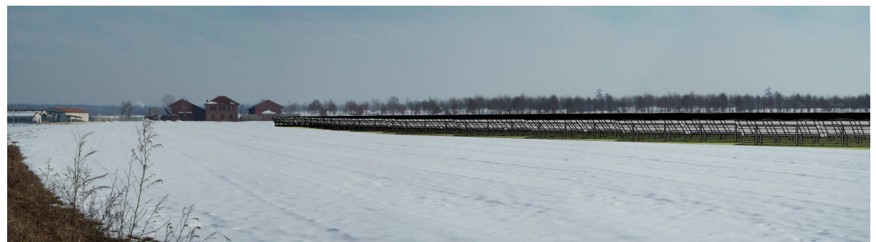
Figure 3. Visual simulation of a ground-mounted PV installation

In the case of sun-tracking systems, the landscape impact becomes greater. This is due to the fact that the sun-tracking system has a greater high above the ground and may easily be seen from the surroundings, and its position changes during the day to follow the sun position. Also the studies to assess the risk of glare from the reflection of the direct sunlight by means of the clear glass PV panel cover are not commonly developed. They are conducted only in cases where the PV plant is near an infrastructure (highway road, airport) or in steep and hilly territories. A methodology to assess the glare risk can be found on (Chiabrando et al., 2009).