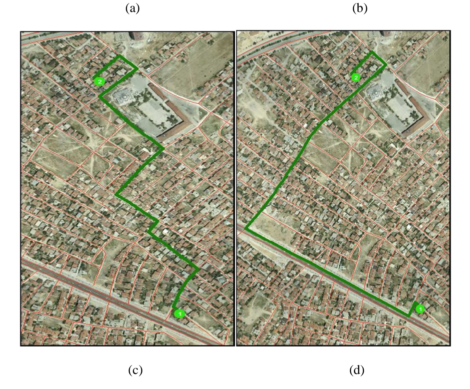
Figure 7: Determined routes with parameters and without