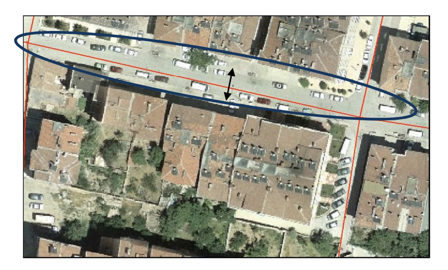
Figure 4: Two sided parking area and street width

In digitizing process, additional to specified parameters, for emergency vehicles, the parameters shown in Table1 has added. For example when digitizing a road segment, it is possible to see the parking status, width of street, crossroads and rail road crossing. Thus, while digitizing, it is possible to define additional parameters. In figure 4 it has shown clearly two side parked, crossroads and width of street.