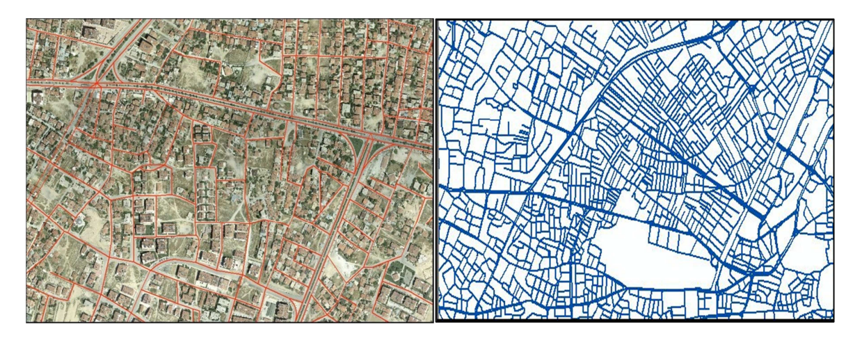
Figure 3: Digitizing process

First step in the application is digitizing the roads from satellite images. To realize network analyst from digitized lines, some parameters must be considered as like way of road, length and turnings. These parameters will play important role in determining routes. Because route will follow the direction of line. In figure 3, digitizing process has shown on satellite image.