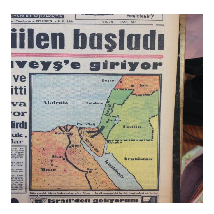
(An Example of a Chorochoroplet map)

During the cartographic evaluations, existence and correct usage of cartographic elements in published maps have been examined. Title, Scale, Legend, Directional Indicator, Inset Map, Text, Resource Information, Projection and Datum Information are the subheadings of Cartographic Elements Title.