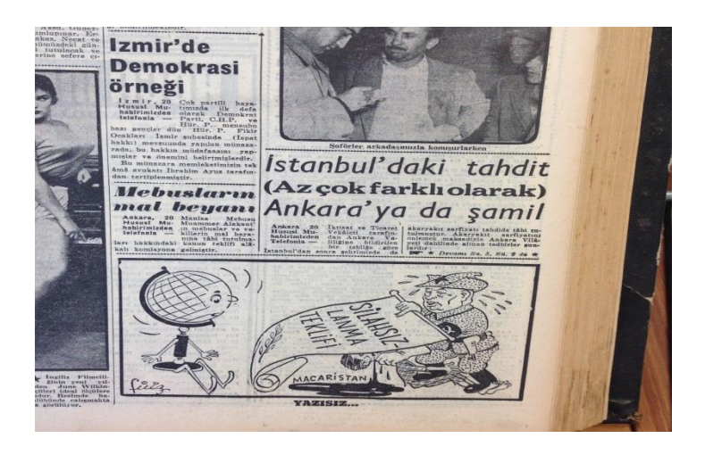
(An Example of a Globe in a Cartoon)

Third classification focus on the parts of the newspaper would be used the maps, such as Report, Sport, Strip Cartoon, Logo, Column, Caricature, Article Series, Commercial, Announcement, Weather Forecast. 'The map is in which part of the newspaper' has been examined. So, 'which part of the newspaper is mostly using the maps as a graphic presentation' have been interrogated.