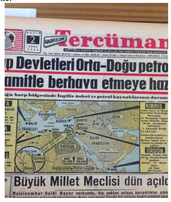
(An Example of Inset Map Use)

During the cartographic evaluations, existence and correct usage of cartographic elements in published maps have been examined. Title, Scale, Legend, Directional Indicator, Inset Map, Text, Resource Information, Projection and Datum Information are the subheadings of Cartographic Elements Title.