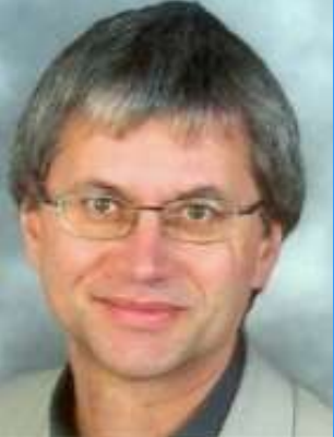
FIG Commission 5 - Positioning and Measurement 2015-2018