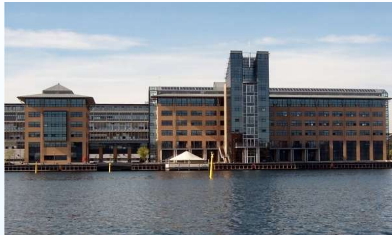
Complex housing the FIG Office, Copenhagen