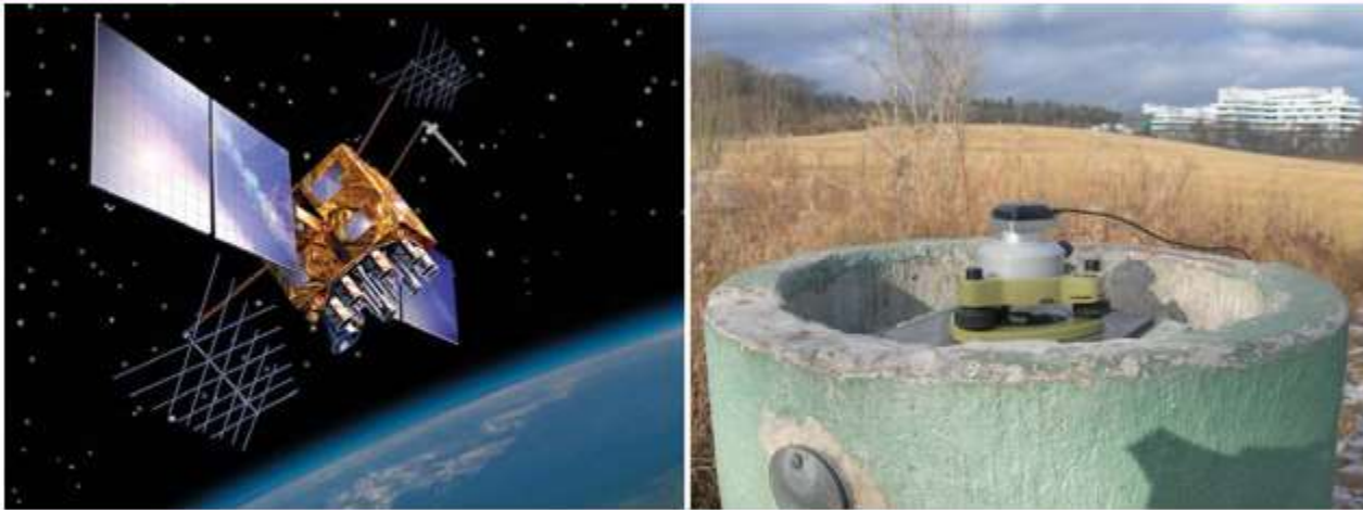
FIG Commission 5 Publication 2 nd Edition