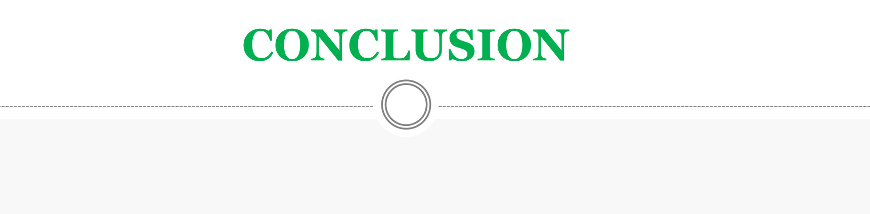
FIG WORKING WEEK 2017 Surveying the world of tomorrow – From digitalisation to augmented reality