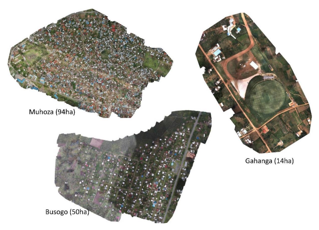
Figure 3: Overview of generated orthomosaics of areas of interest (scales vary).

Northern Province, weather conditions change very fast and can require spontaneous changes in the flight plan. When the UAV data collection necessitates two or more flights, different illumination conditions can lead to differences in image quality (cf. Busogo dataset).