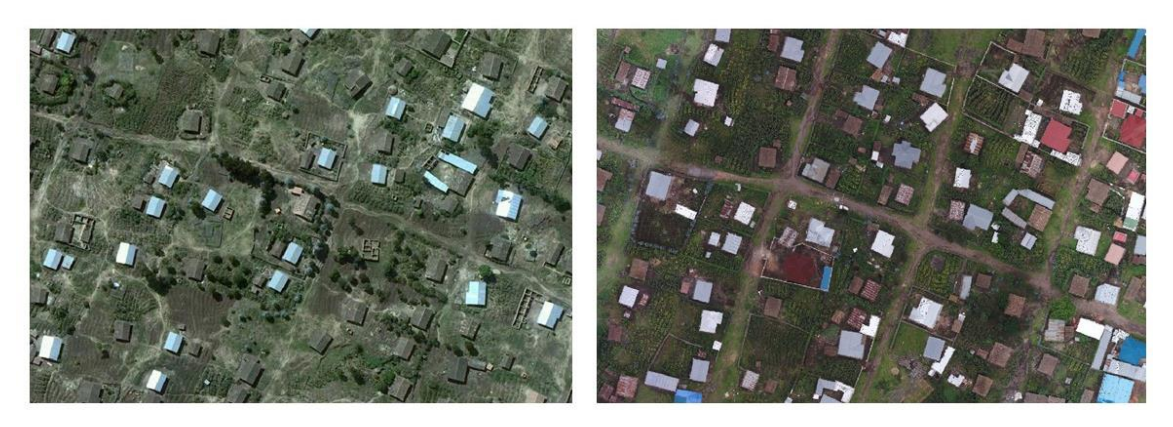
Figure 4: Left: Orthomosaic based on aerial images from 2009; right: Orthomosaic based on UAV images from 2018

More specifically, the expressed need by government stakeholders for higher accuracy data can be completely met by UAV imagery. Ground resolution of less than 10cm provides a high level of detail to extract actual land use information and geospatial information to directly demarcate the parcel boundary in the orthomosaic. Furthermore, the high level of absolute accuracy achieved by a UAV-based orthomosaic can support the calculation of plot sizes – a need which was prioritized by the cell-level stakeholders. Moreover, the flexibility of UAV data collection supports the collection of timely base data for on-going and current tasks such as the revision of the Master Plan in secondary cities or development plans for urban and peri-urban settlements. Frequent changes in land use can be tracked and monitored by means of repetitive UAV data collection activities. Additionally, disputes about former land ownership and land use can be solved more easily with the existence of a multi-temporal database.