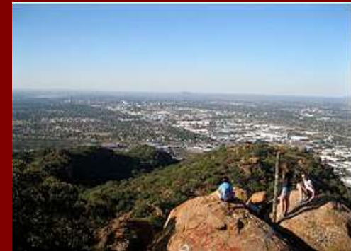
Gaborone City From top of Kgale Hill