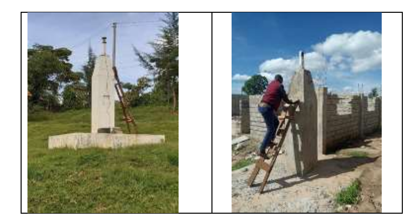
Figure 3: KENREF Pillars