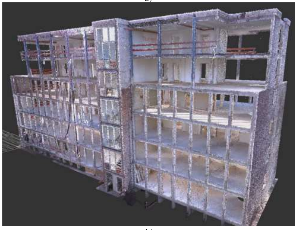
b) Figure 4. Point cloud of scanned object -a) part of the object b) whole object

Application of Terrestrial Laser Scanning Technology for the Purpose of Creating 3d Models of Objects (11056) Tatjana Kuzmić, Marko Marković, Mehmed Batilović and Vladimir Bulatović (Serbia)