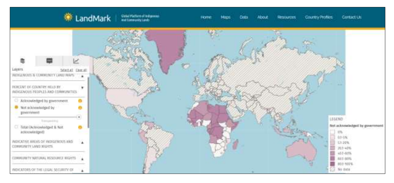
Figure 1. More than half of the lands held or used are still not acknowledged by the government in many countries worldwide. Data from (Dubertret and Alden Wily, 2017). Map from <u>http://www.landmarkmap.org/</u>.

Land has a central role to livelihood, identity and power. The documentation of land rights is an essential step to make progress towards a more peaceful and sustainable future of our planet and for achieving the SDGs, with Goal 1 "No Poverty" (Indicator 1.4.2: proportion of total adult population with secure tenure rights to land) in particular. In most cases, the land of indigenous people is governed by customary law and informal arrangements ruling community allocation, access, use and transfer of land and natural resources. In contrast to statutory tenure, customary tenure is usually not fully protected by the state. Millions of those customary land rights are still undocumented. Evidence presented in Figure 1 shows that in some countries, more than half of the lands held or used by indigenous communities are still not acknowledged by the government.