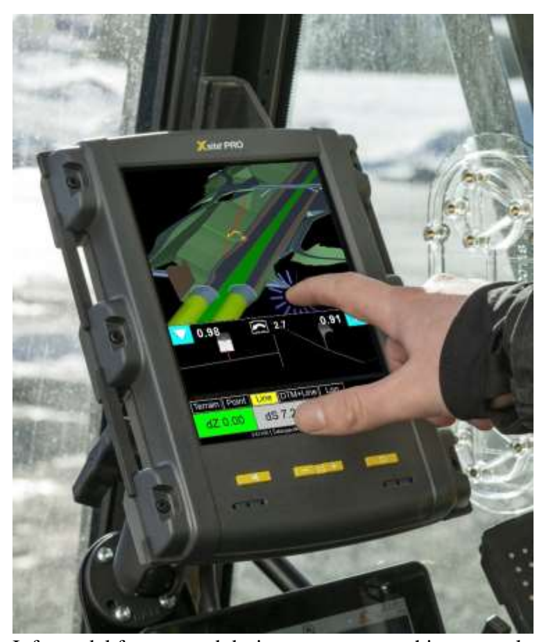
Inframodel format road design seen on a machine control system screen in an excavator.

In the new model-based workflow, instead marking out with physical of stakeout sticks, the quality-controlled models were transferred from the project office directly to machine control systems in the field. Making latest design data available for the machine operator with just few clicks on the touch screen.