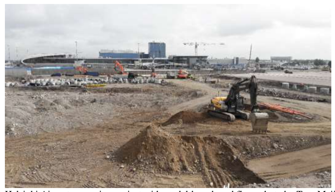
Helsinki Airport expansion project with model-based workflow, photo by Tero Maijala.

With digital design models, it was possible to use these models directly in the machines fitted with machine control systems, so the additional physical markings in the field were not anymore needed. This was also the most visible change in the process and infrastructure project locations could not be any more defined by the hundreds of wooden stick standing on construction sites.