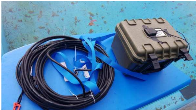
Figure 1: Multi Sensor System on swimming platform

For collecting test data two test runs have been carried out for the Multi Sensor Platform (Figure 1). The principal idea was to obtain one dataset from an area with known and foreseeable water depth and little to no variation in the bathymetry. Another dataset was to be acquired in open water meaning unknown bathymetry and possibly a variation on the sea floor. Both test runs were carried out on a small-scale area with survey lines no larger than 20 to 30 metres.