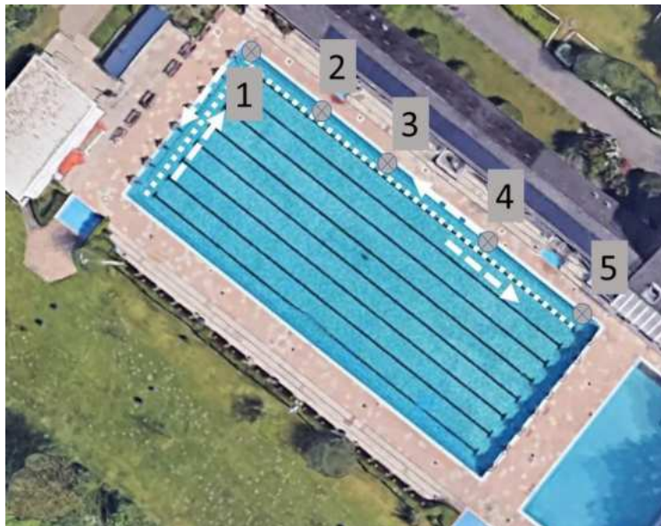
Figure 2: Overview of the test run area

For collecting test data two test runs have been carried out for the Multi Sensor Platform (Figure 1). The principal idea was to obtain one dataset from an area with known and foreseeable water depth and little to no variation in the bathymetry. Another dataset was to be acquired in open water meaning unknown bathymetry and possibly a variation on the sea floor. Both test runs were carried out on a small-scale area with survey lines no larger than 20 to 30 metres.