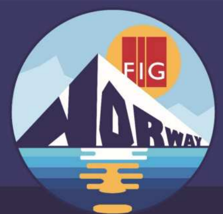
FIG Working Week 2027