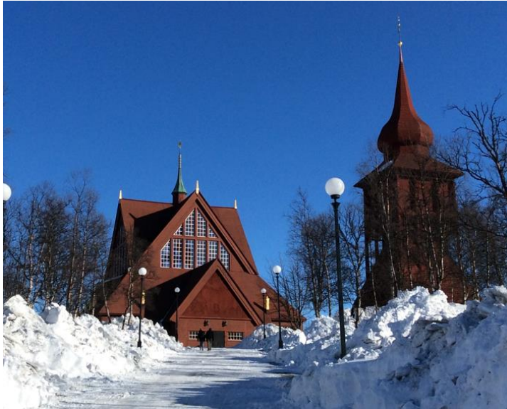
Figure 2. The Church of Kiruna, planned for relocation to the new city center.

The relocation of Kiruna has had major consequences for the local community and many stakeholders have been faced with a fait accompli when the city is required to move. Many private landowners have reached voluntary agreements with the mining company, but not everyone. Given the relatively weak local property market, it is also not obvious that the compensation offered to a property owner is sufficient for that actor to be able to acquire a newly produced building with a corresponding purpose in the new part of town. In addition, there is a great housing shortage when many existing buildings are being demolished.