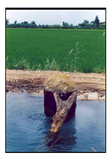
Figure 4: Salty Water producer wells

Therefore, there was always seepage of salt water from and around the wells. Some of these wells are producing salt water continuously that flows in the valley (Figures 5).