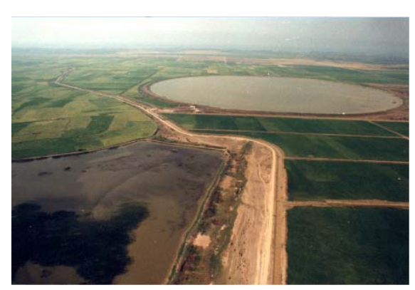
Figure 3: The evergreen valley in Mazandaran

Many wells were drilled in this valley since 1961 and in a greater number in 1981 and thereafter to supply the appropriated amount of water to the valley that maintain the valley to be evergreen with a very useful demanded agricultural products, where the rice is one of them (Figure 3).