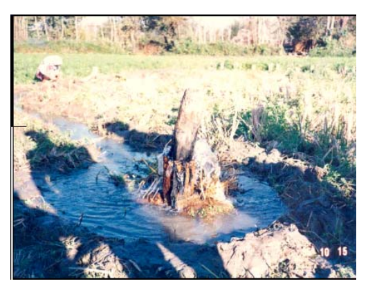
Figure 5: Salt water from wells flows into the valley