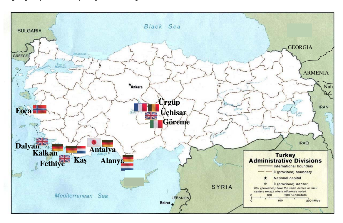
Figure 3: Regions Preferred by Foreigners in Turkey

In Turkey, touristic and historical places are dense particularly in the regions of Aegean and Mediterranean. Indeed, areas in which foreigners acquire real property are also mostly located in these regions. Investors have consisted of retired people over the middle age. The average price of houses acquired is 70000 US$. These people have preferred identical region to live together. Besides, they have preferred to purchase villa or to build dwelling by buying estate. The location of preference regions in which citizens of selected some countries acquire real property in Turkey is given in Figure 3 (Kas, 2003).