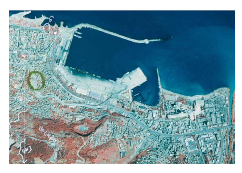
Fig. 5: The new dated image covering coastal zone in the study area

The hardware and software used in the study included Z/I Imaging SSK digital photogrammetric system working on workstation and MicroStation V8 from Bentley. Imagery was processed in SSK performing model orientation and extracting topographic features. Because of the nature of the triangulation algorithms in SSK, some ground control points are required to give initial approximations of the model, as both the relative and absolute orientation stages are performed simultaneously. Four ground control points were scaled from existing mapping and measured in one stereo pair. After the model oriented from the images in 1973 and 2002, respectively, the coastal line and other topographic features were measured.