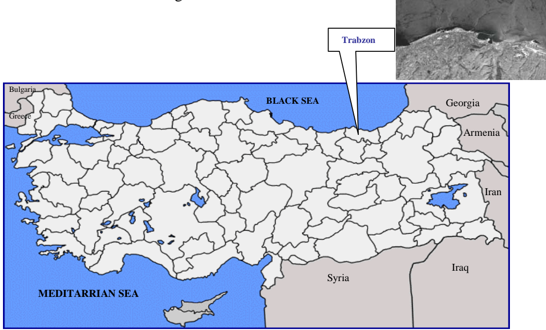
Fig. 3: Location map of the study area

As shown in Figure 3, the study area, Trabzon, is located in the north-east of Turkey and is about 3 km length of coastal zone. The city centre and its coastal zone were dealt with to examine coastal land use change.