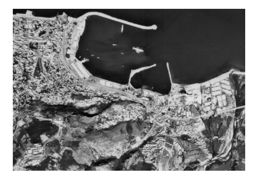
Fig. 4: The old dated image covering coastal zone in the study area

The hardware and software used in the study included Z/I Imaging SSK digital photogrammetric system working on workstation and MicroStation V8 from Bentley. Imagery was processed in SSK performing model orientation and extracting topographic features. Because of the nature of the triangulation algorithms in SSK, some ground control points are required to give initial approximations of the model, as both the relative and absolute orientation stages are performed simultaneously. Four ground control points were scaled from existing mapping and measured in one stereo pair. After the model oriented from the images in 1973 and 2002, respectively, the coastal line and other topographic features were measured.