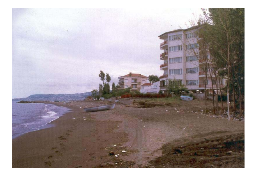
Fig. 1: The Example of land use violating the law in Trabzon