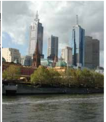
FIG Commission 9 – Valuation and the Management of Real Estate