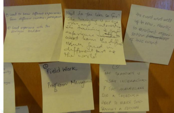
Figure 20 Post-it feedback on ''What do you like so far?''

In general all participants enjoyed the training and were excited to share the knowledge and experience gained with their country back home. Based on the positive feedback, a follow up Group Discussion (according to respective countries) was conducted to get insights of participants hopes and action plan after the STDM ToT. During the presentation, all participants agreed on the relevance of STDM in their respective countries in giving awareness about all people land relationship.