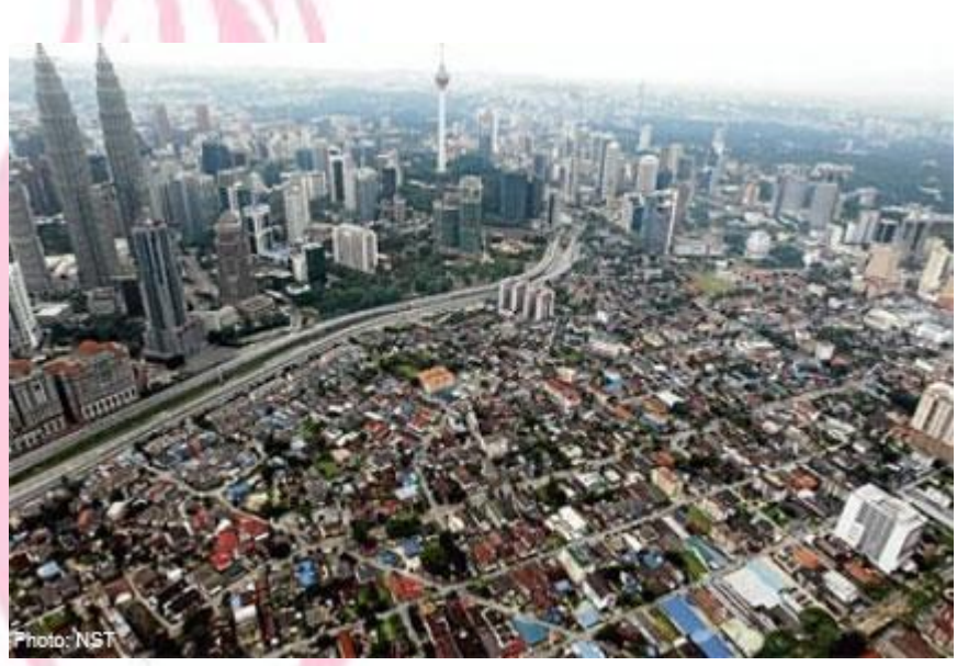
Figure 11 An aerial view of Kampung Baru (foreground).

Eight (8) groups were organized to test the enumeration STDM questionnaire in Kampung Baru, a village within Kuala Lumpur which has maintained its old form and preserved ethnic Malay culture in the city centre. It is now being subjected to pressure among the community, government and developers because of high land the value. Interestingly, YSN Malaysia has arranged for participants to experience a wedding reception of a Malay couple prior to the field exercise.