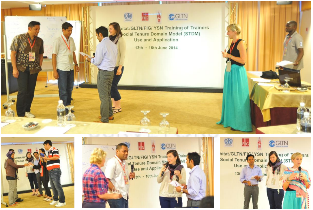
Figure 9 Role-playing exercise prior to the field STDM exercise

Then, a role-playing activity was acted out by selected participants to show different situations in doing the interviews with household members. How the interview should be conducted is discussed after each situation, including comments on the substance of interview statements and questions.