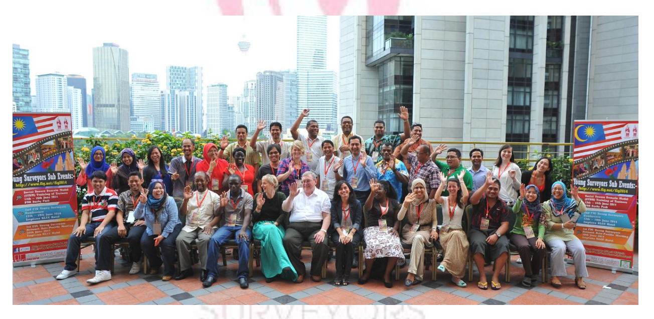
Figure 1 The STDM ToT participants with the FIG Foundation President

LINK TO FIG COMMISSION: Commission 1 – Professional Standards and Practice; Commission 2 – Professional Education Commission; Commission 7 - Cadastre and Land Management; Commission 8 – Spatial Planning and Development and Young Surveyors Network