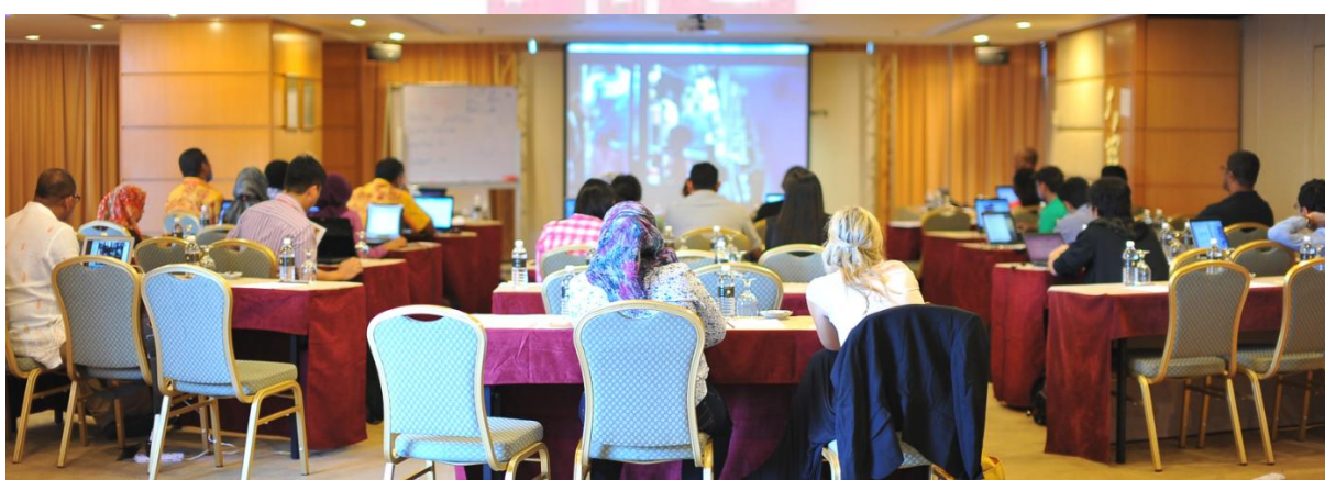
Figure 19 Participants concentrated on the short video of STDM prepared by UN Habitat - GLTN

The day then proceeded with hands-on training of the STDM Software package that was conducted by Solomon Njogu, from GLTN. The software was developed by GLTN and its partners. It is an open source based GIS software package.