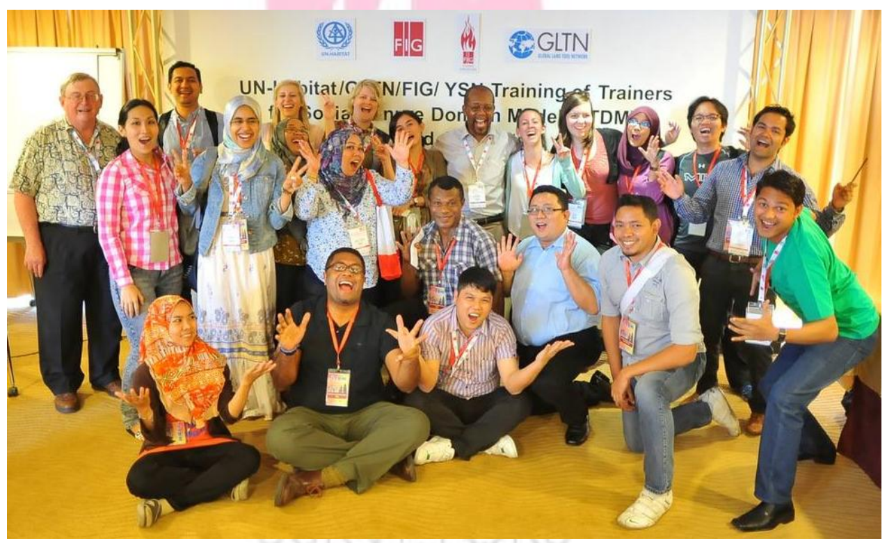
Figure 23 Excited STDM participants to venture new possibilities with STDM

In a nutshell, the STDM ToT was a success. With the knowledge gained throughout the three and a half days STDM ToT, all "Young Ambassadors" are ready to assist UN-Habitat/GLTN in future work, research and rolling out STDM.