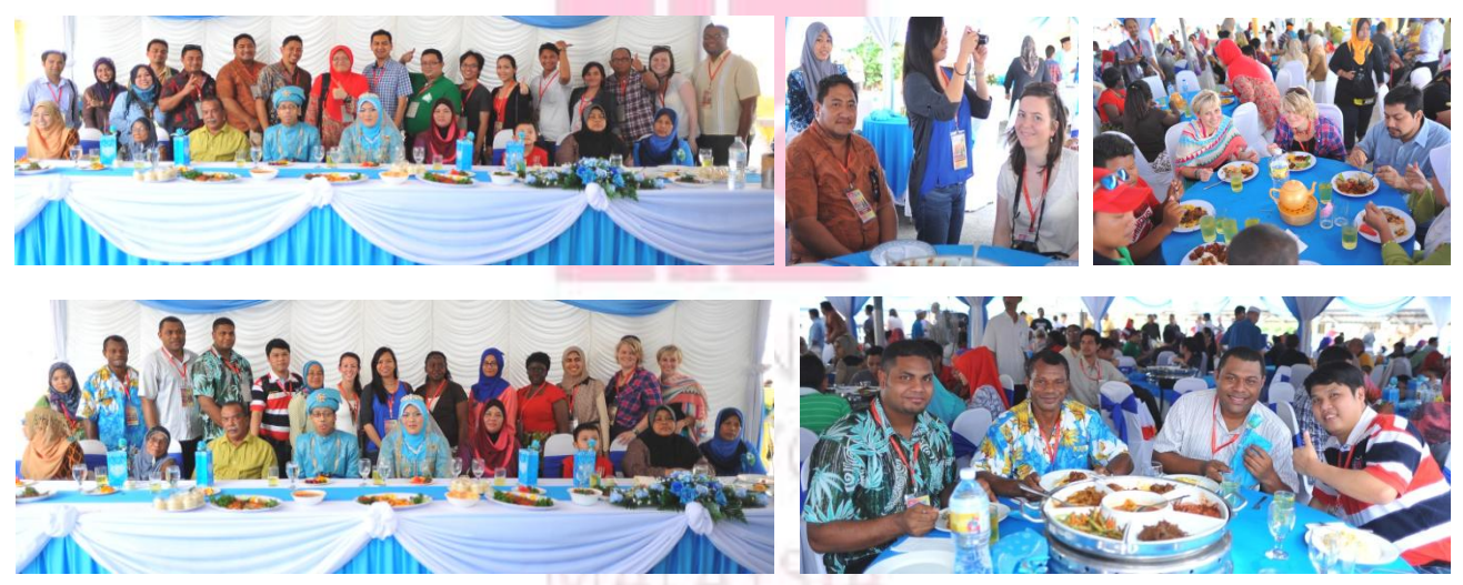
Figure 12 STDM participants got the opportunity to attend a Malay wedding at Kg Baru and familiarised with local customs