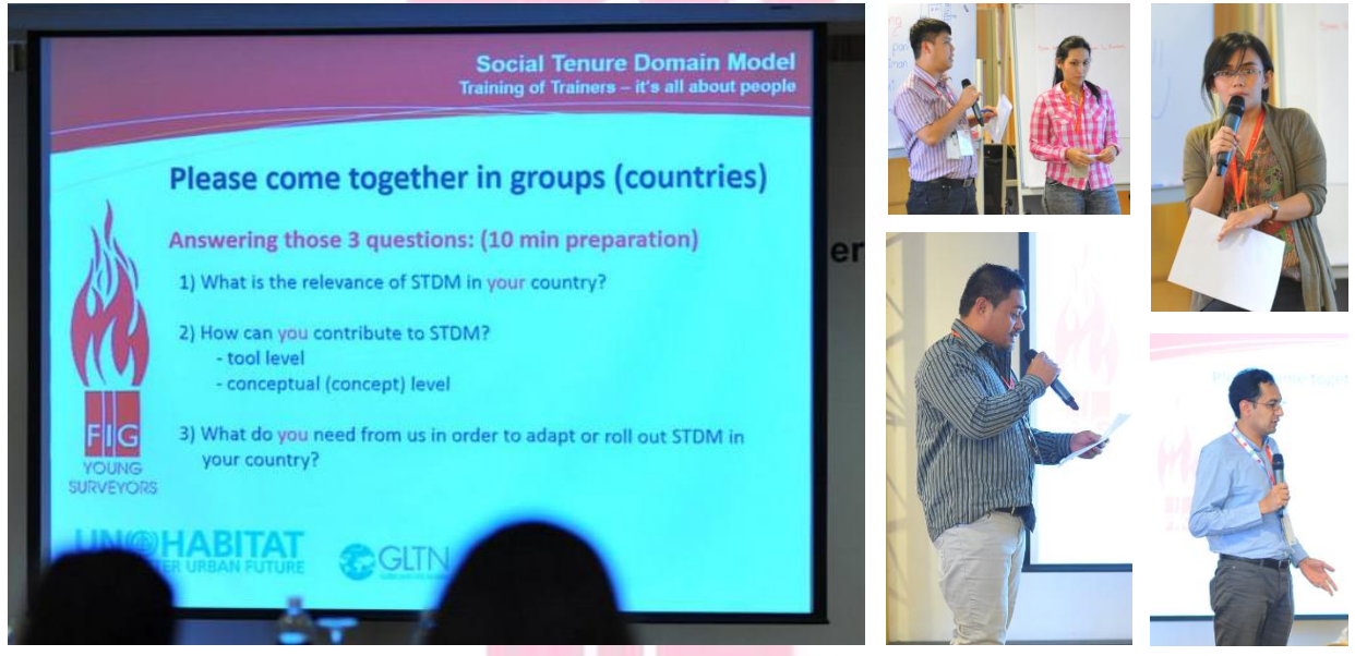
Figure 21 Group Discussion on STDM ToT

In general all participants enjoyed the training and were excited to share the knowledge and experience gained with their country back home. Based on the positive feedback, a follow up Group Discussion (according to respective countries) was conducted to get insights of participants hopes and action plan after the STDM ToT. During the presentation, all participants agreed on the relevance of STDM in their respective countries in giving awareness about all people land relationship.