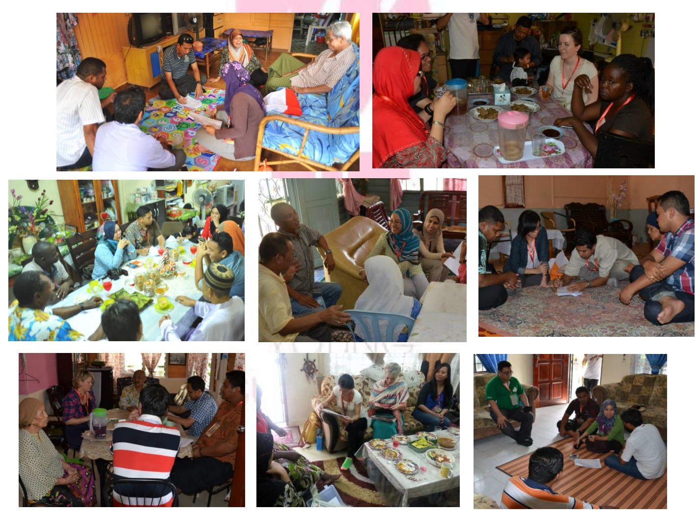
Figure 14 Enumeration interview exercise with the Kg Baru households