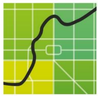
FIG Working Week 2016