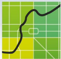
FIG Working Week 2016