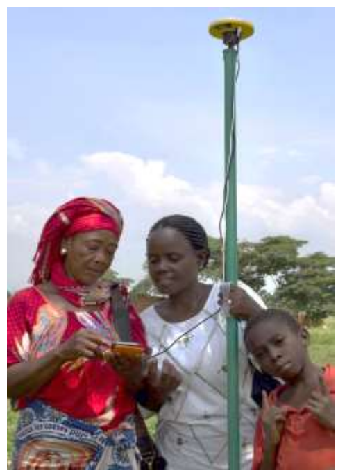
Two community members learning how to become para-surveyors using a smartphone and an external GNSS antenna to increase the positional accuracy in Luberizi, South Kivu, Democratic Republic of Congo.

having these newly qualified women surveyors join land professional organizations, they will have access to higher competences and eventually get job opportunities in the construction industry, urban and rural planning, or even conservation. Involving women in the land and surveying profession is essential, especially if we want to have women participate as full actors in the process of economic development.