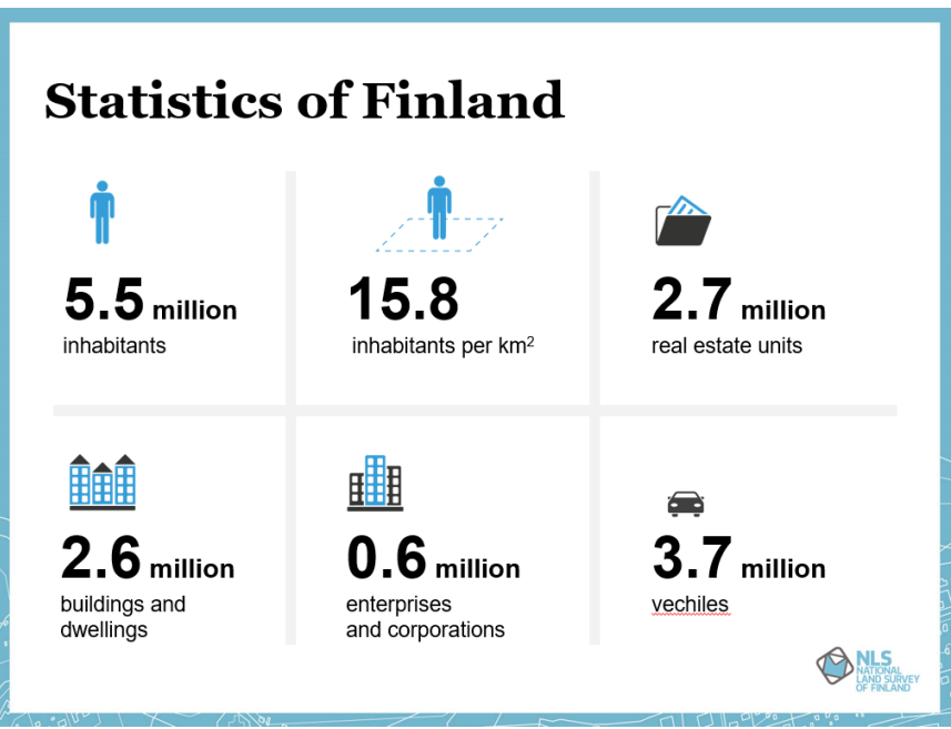
Figure 2. Statistics about Finland

In parcelling processes, cadastral surveyors are obligated to find a solution in parcelling issue. This means that they cannot assign their cases to other surveyors. But if in title and mortgage issues a case exceeds the competence level of a surveyor, they must assign it to a specialist or legal counsel for further processing. It is estimated that roughly 95% of all registrations are normal cases that do not need to be reassigned.