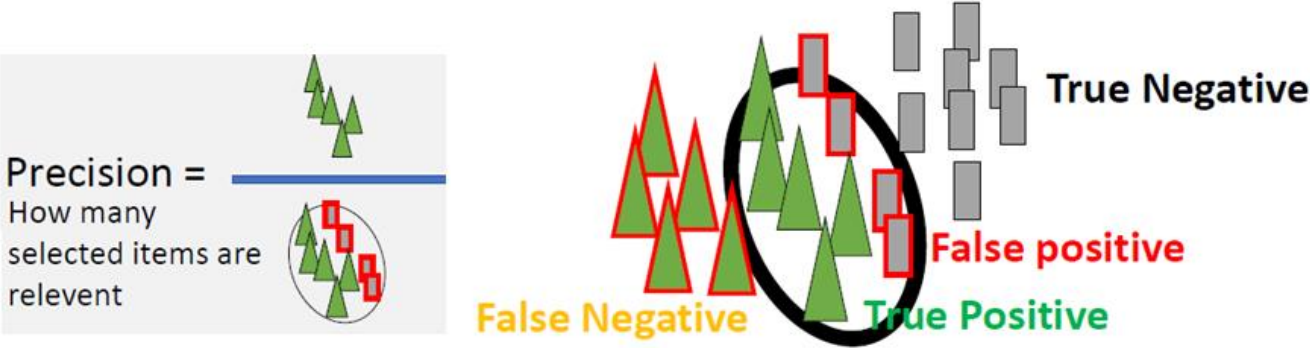
Figure 5: Precision

In the case of UTC and the purpose of cost assessment, the objective is to know how many trees were identified correctly rather than how many were falsely labeled. In other words, small trees, trees without leaves etc. weren't expected to be detected. The precision of the classification was the main goal rather than the shape of the canopy contour. After several days of training and testing, the model's outcome was 96% precision.