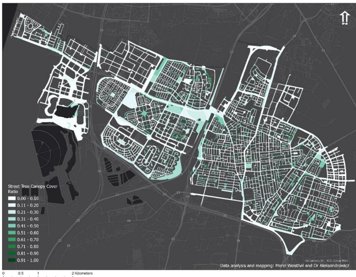
Figure 6: A street-segments Tree Canopy Cover map of the city of Rishon LeZion, based on the raw tree canopy mapping produced by the Survey of Israel and additional spatial analysis (data analysis and mapping by Morel Weisthal and Or Aleksandrowicz)

The availability of high-resolution mapping of tree canopies alongside DSM and DTM raster layers of urban areas in Israel opens up new opportunities for analyzing the climatic and environmental properties of large urban areas based on several metrics [8]. Probably the most immediate of them is that of a Tree Canopy Cover (TCC) ratio at different scales. A TCC ratio describes, on a scale of 0 to 1, the ratio between the area of the projection of all tree canopies located within a certain space on a horizontal plane and the total area of the same space. The higher the value, the higher is the tree canopy cover of the area. TCC ratios are normally calculated for the entire urban area or at the neighborhood level. Nevertheless, assuming we are interested in TCC values of smaller spatial units (street segments, urban open spaces), the high-resolution mapping of tree canopies enables us to generate maps showing hierarchies of shade-tree provision at the scale of the most basic urban design units. Such maps can become an important tool for planners and designers in locating weak and strong points in the current distribution of trees in public spaces and particularly street trees.