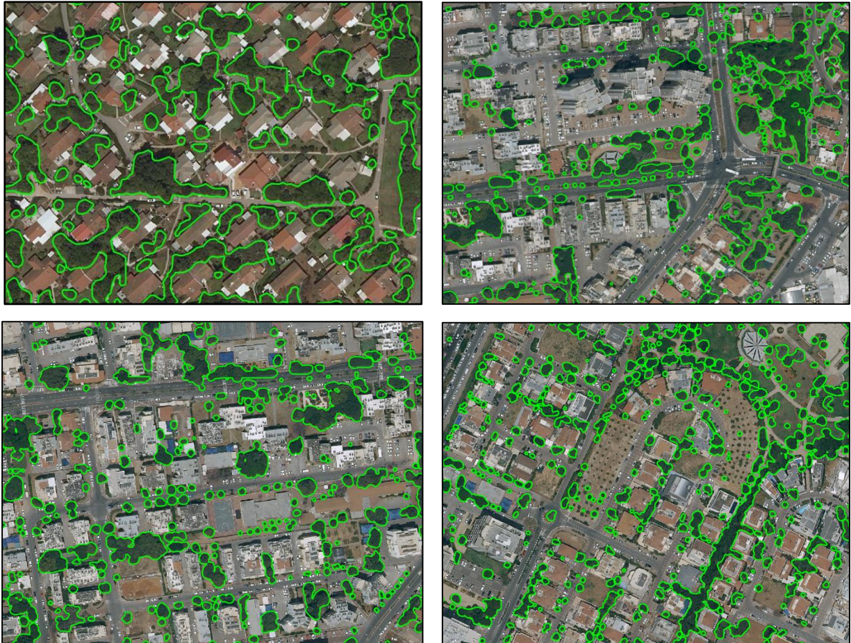
Figure 3: Canopies Segmentation Results

The trained model applied on a new raster image and its ability to detect tree canopy is examined. Then, manual quality control is performed. Figure 3 presents typical results of the UTC in urban areas.