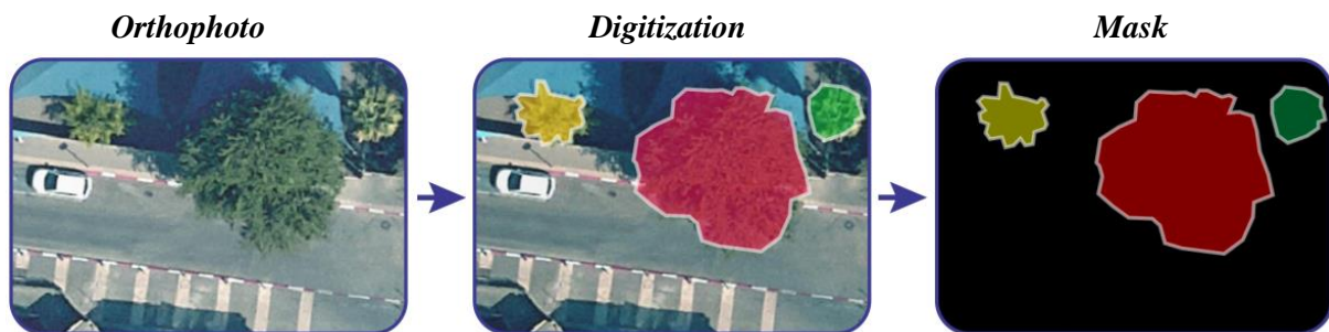
Figure 2: Mask Production

Every model of DL requires sample data – examples of the objects to be identified. To this end several hundred masks were created by means of manually digitizing tree canopy on orthophoto tiles, as shown in Figure 2 . The vector data was then rasterized to create the mask dataset (GDAL 3 library was used). It is important to mention, that the Survey of Israel is in charge of producing a high resolution (20 cm per pixel) orthophoto annually. The aerial image includes 4 bands: RGB and the NIR.