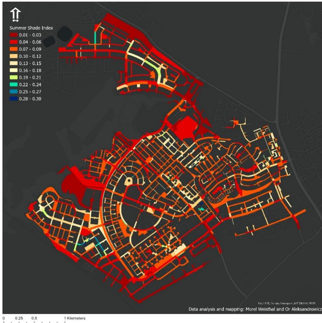
Figure 7: A summer shade map of the town of all street segments and open spaces in the town of Netivot, based on a DSM, a DTM, and the raw tree canopy mapping produced by the Survey of Israel and additional spatial analysis. The values represent the Shade Index of each spatial unit (data analysis and mapping by Morel Weisthal and Or Aleksandrowicz)

When calculated for a relatively large number of street segments and neighborhoods, the SI can reveal the variance in street-level insolation across an entire urban area, and therefore can be used by planners and designers for prioritizing interventions focusing on outdoor shade provision. Through shade mapping, a municipality may decide to designate certain streets for "shade intensification" (in streets of low shade values) or "shade conservation" (in streets of exceptional levels of shade). The prioritization can integrate additional quantifiable factors, such as the likelihood of a street to attract pedestrians or the socioeconomic condition of a neighborhood. For example, streets prioritized for "shade intensification" can be defined as only the streets with low SI values and high likelihood to become pedestrian attractors.