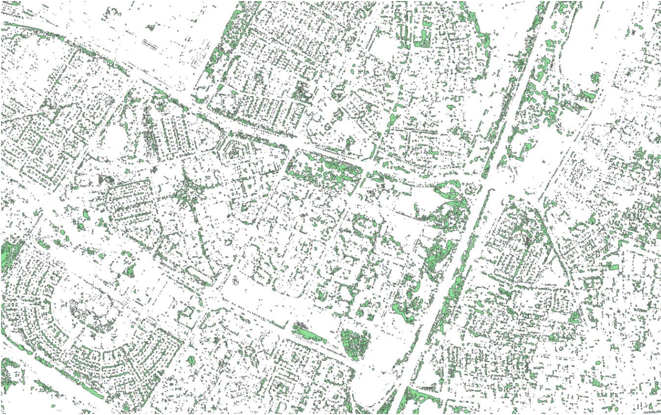
Figure 4: The TC of Rishon LeTsyion Municipality

displayed. Allowing the stakeholders to make strategic decisions regarding planting efforts and track the UTC goals progress on a continuous basis.